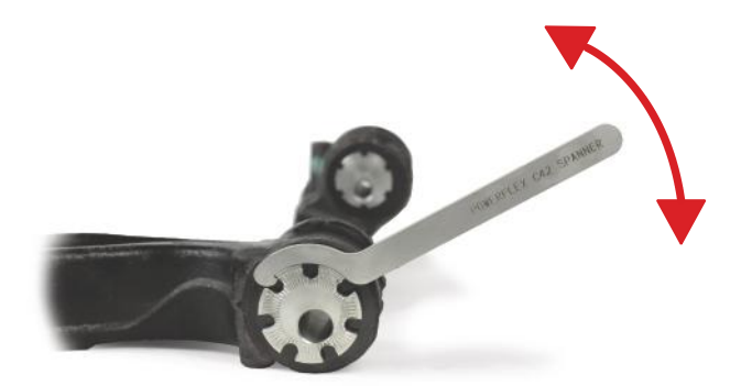
Figure 2 - Adjusting the Geometry

POWERFLEX +44 (0) 1895 460033 sales@powerflex.co.uk www.powerflex.co.uk